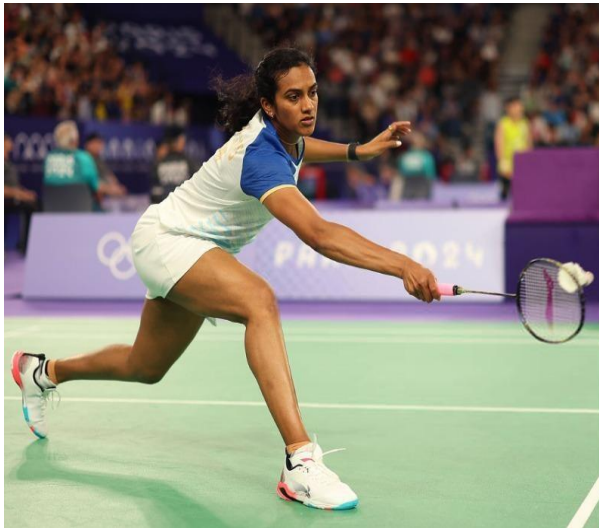
Miss. P V Sindhu, Badminton, Silver and Bronze Medalist in Olympics (2016 & 2020), Padma Bhushan Awardee

The policy envisions to support sports activities for individuals above 45 years old across various disciplines i.e., Athletics, Badminton, Cricket, Tennis & Swimming.