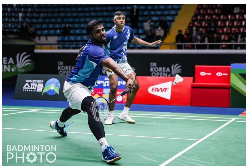
Sri Satwik Sai Raj, Badminton, Olympian, Gold Medalist in Asian Games (2023) & Major Dhyan Chand Khel Ratna Awardee

Prepare a comprehensive, discipline-wise report ranking Andhra Pradesh's performance in various sports disciplines at the national and international levels and this report will help identify key strengths, areas for improvement, and guide resource allocation to strengthen high-potential sports