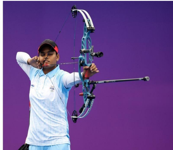
Miss. Jyothi Surekha, Archery, Secured 3 Gold Medals in Asian Games (2023), Arjuna Awardee